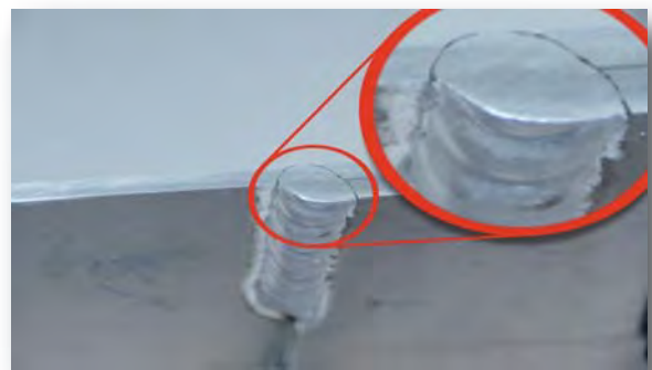
Weld Must Have Deep Penetration