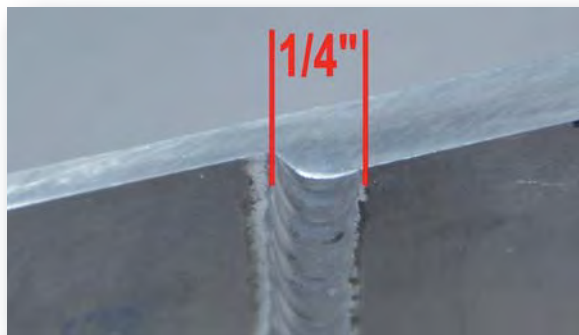
Weld Must Be 1/4 Inch Wide

While we're on the topic of welds, regardless of the material you choose, the welds hold the pieces together and prevent leaks if done correctly. Ask for a picture with a close up view of their welds. What you are looking for is a convex weld 1/4 inch wide that is continuous with no porosity. It should have deep penetration into the metal. The photos below show a close up view and a cross section of what you are looking for.